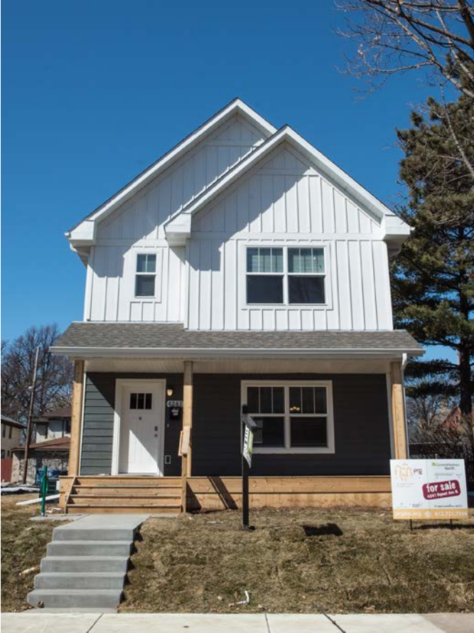
A new PRG construction in North Minneapolis.

2018 marked ten years serving as PRG's executive director. It's a natural time to reflect and to think about the next ten years.