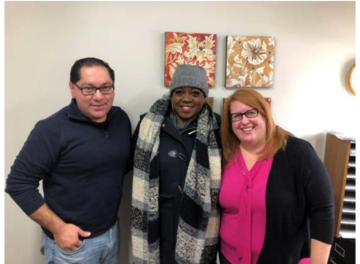
A homeownership advising client after receiving good news about her credit score.

We are closing the homeownership gap one house at a time. Of households of color participating in our pre-purchase services, 52% go on to purchase a home within three years. This translates to approximately 275 new homeowners of color annually.