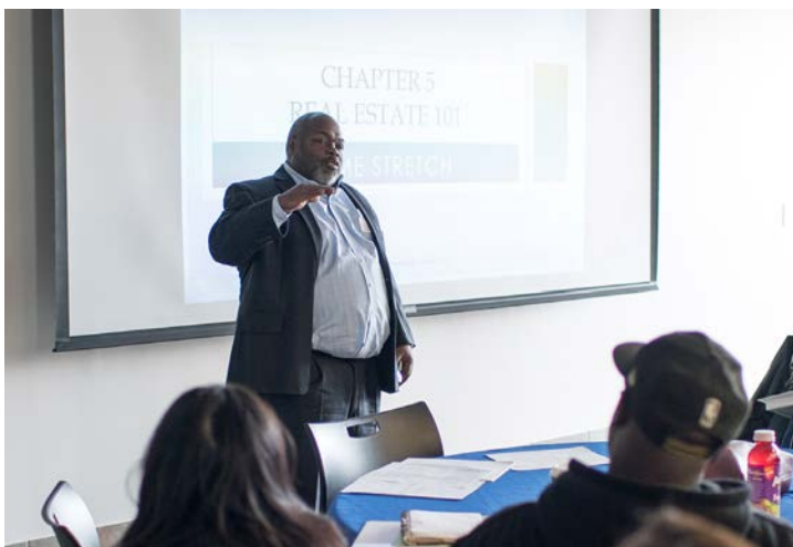
Real estate professionals share their knowledge and expertise with Home Stretch participants.

PRG also provided free, one-on-one foreclosure prevention assistance to 40 families.