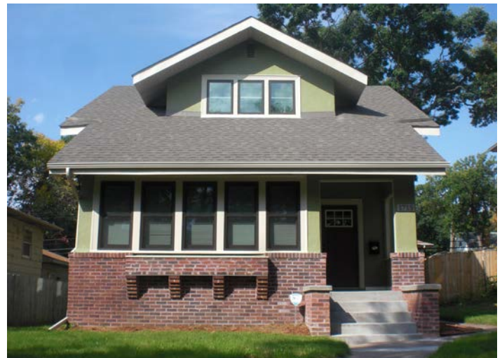
Before and after photos of a PRG rehabilitation of a single family home in north Minneapolis.